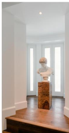
No 1 Palace St, The St Regis Residences, London

CONTACT: ILONA LEE INFO@ILONALEE.COM +1 917 291 9491